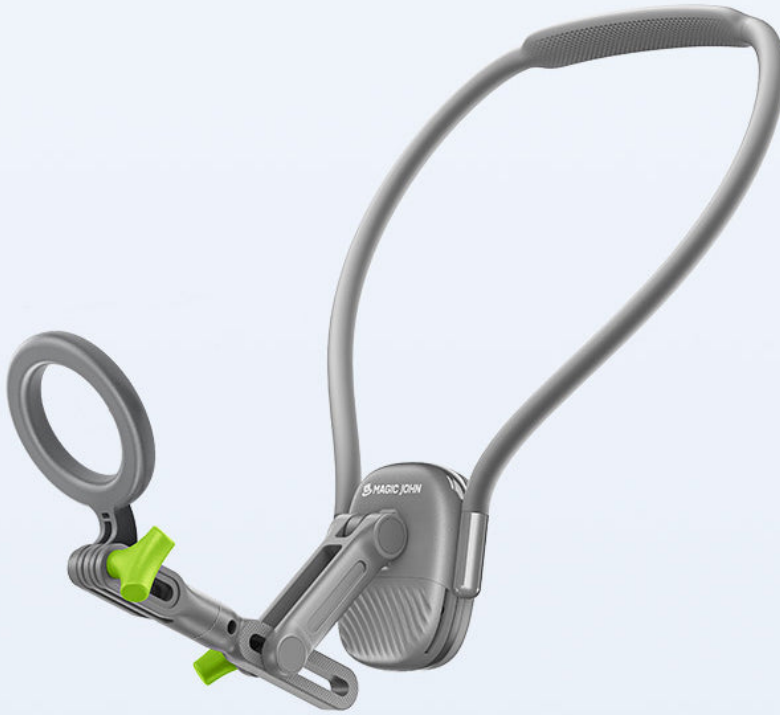
Neck Phone Holder x1