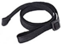
Telescopic Strap x1