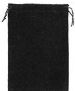
Storage Pouch x1